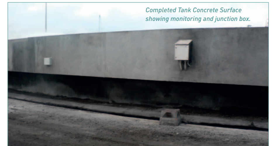
Completed Tank Concrete Surface showing monitoring and junction box.

Ian Godson & Luke Thompson – Infracorr Consulting Pty Ltd