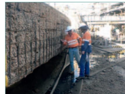
Launder wall after hydro-demolition has removed the delaminated and spalling concrete.

The anode installation was completed progressively around the tank. Permanent reference electrodes ( MnMnO_2 ) were installed initially with 36 installed in monitoring areas around the tank. The 30mm diameter holes were percussively drilled initially and soaked with water for 24 hours to maximize the moisture in the concrete. The anodes were installed in the holes in the alkaline paste backfill in batches (sub-zones), checked for isolation from the reinforcement and immediately powered by the temporary transformer rectifiers at 12 volts. The impressed current was maintained at 12 Volts for a minimum of 7 days, with the current recorded daily in each sub-zone. A minimum current criterion of 50 KC/m 2 reinforcement area was maintained to ensure the reinforcement was completely passivated. Once the impressed current criteria was met, the system