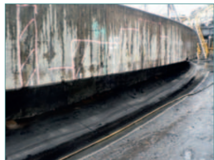
Corroded Reinforcement causing concrete spalling in the external launder wall of the tank

The repair of the tank was to extend the life of the structure for a minimum of 30 years with the main client requirement to minimise downtime of the tank during repair works to a maximum of 2 weeks for other works inside the tank.