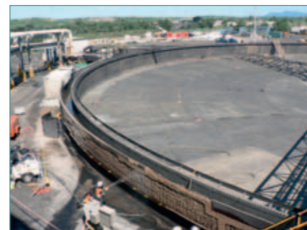
Coal Thickener Tank during 2 week shutdown. Hydro-demolition & dry process gunite progressing around the tank.

The works commenced in late January 2011, with hydro-demolition utilized around the clock to maximize the productivity of defective concrete removal which was required up to but not behind the bar. The exposed reinforcement was checked for electrical continuity with isolated problems resulting in a 6mm continuity bar being required, tack welded to all vertical bars around the tank. Dry process gunite closely followed the hydro-demolition and continuity work, restoring the concrete to the original profile, with cover to the reinforcement of approximately 20mm. All hydro-demolition and gunite repair was completed during the tank shutdown of two weeks, with the tank re-filled and restored to full operating condition by mid February 2011.