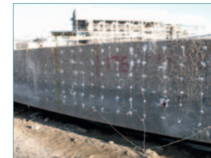
Anodes Installed in Proprietary Paste backfill and powered at 12V from the temporary transformer rectifiers

Evaluation of the system performance was assessed against a corrosion rate criterion based on the Stern Geary Equation, with the targeted corrosion rate to be less than 2mA/m 2 steel, approximately equivalent to a 2mm section loss in 1000 years (this criterion is in the latest European CP standard, ISO12696). This was measured by recording the galvanic current of the sub-zone and completing an instant off and depolarisation test (similar to impressed current